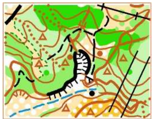
Middle Distance Map' Snip